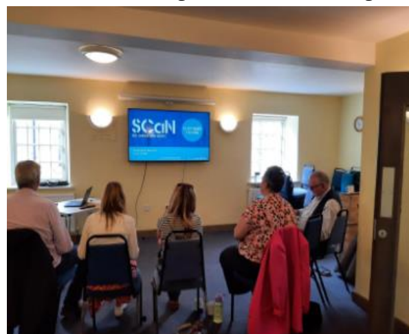
Recent SCaN training delivered in Pickering

“The event encouraged open discussion and networking. I found all three sessions very interesting, particularly the training on Bleed Kits”.